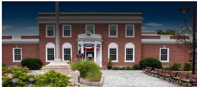
JFK Museum - Hyannis