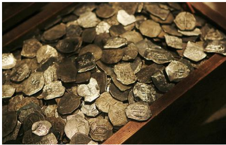
Whydah Pirate Museum