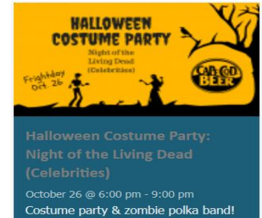
Cape Cod Beer