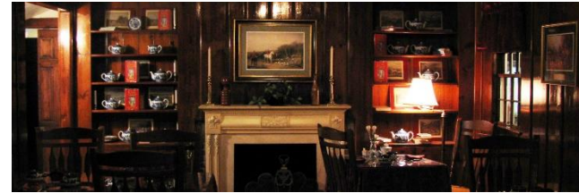
Sandwich Glass Museum and Dunbar Tea Room