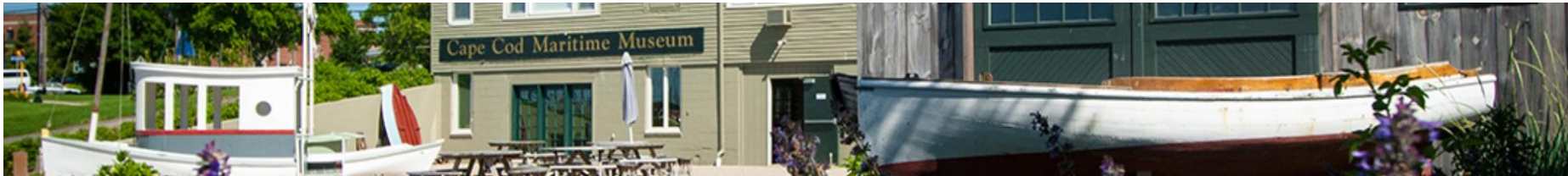
Cape Cod Maritime Museum