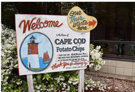
Cape Cod Potato Chips