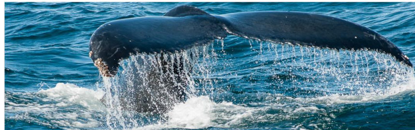
Hyannis or PTown Whale Watcher Cruise